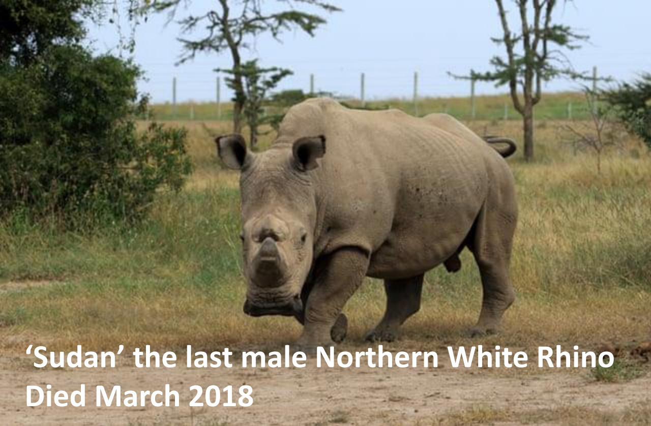
‘Sudan’ the last male Northern White Rhino Died March 2018