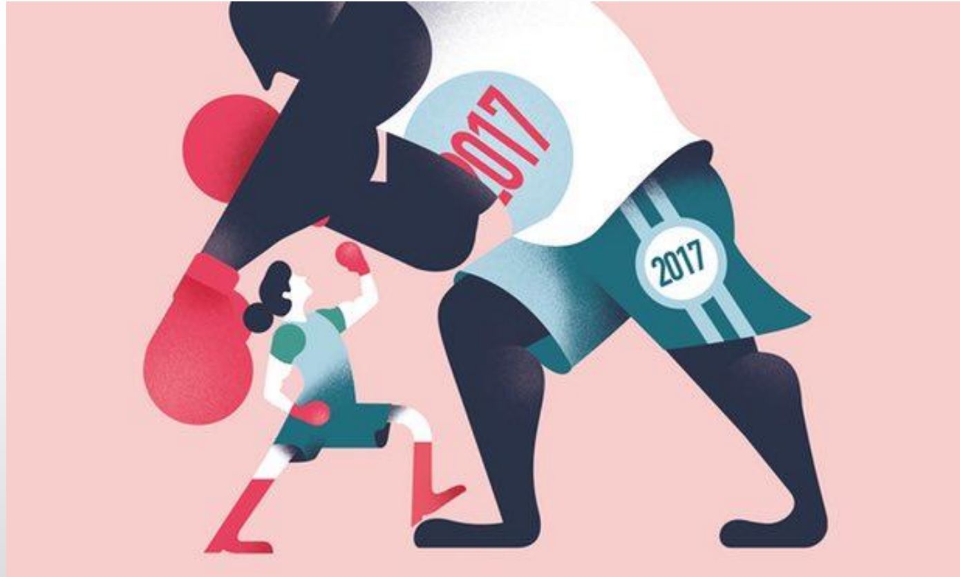
Illustration: Natalie Lees